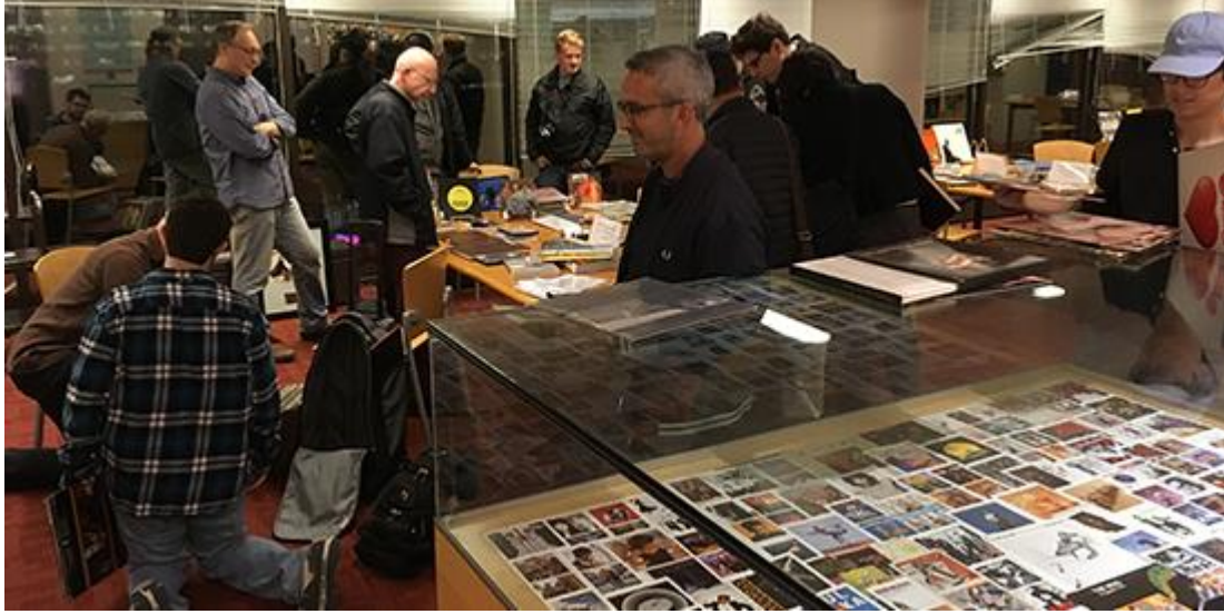
Customers check out the library's music-related resources