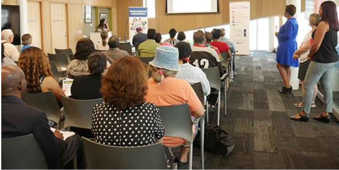
Job seekers learn about library resources