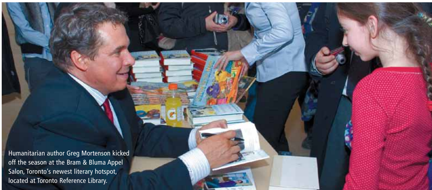
Humanitarian author Greg Mortenson kicked off the season at the Bram & Bluma Appel Salon, Toronto's newest literary hotspot, located at Toronto Reference Library.