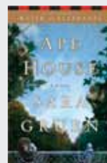
Ape House Sara Gruen