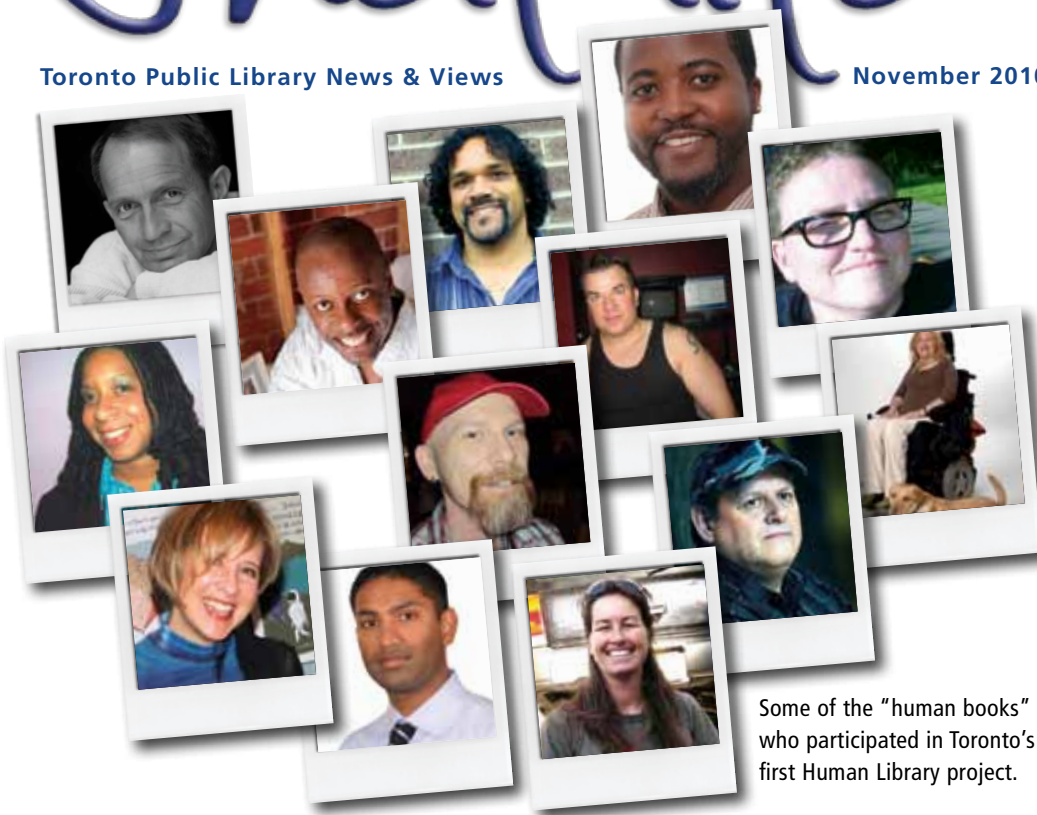
Some of the "human books" who participated in Toronto's first Human Library project.