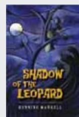
Shadow of the Leopard Henning Mankell