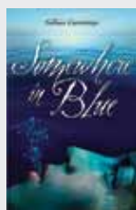
Somewhere in Blue Gillian Cummings