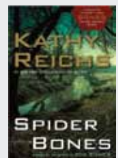
Spider Bones Kathy Reichs