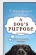
A Dog's Purpose W. Bruce Cameron