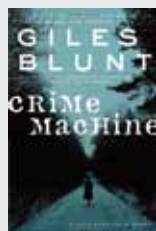
Crime Machine Giles Blunt